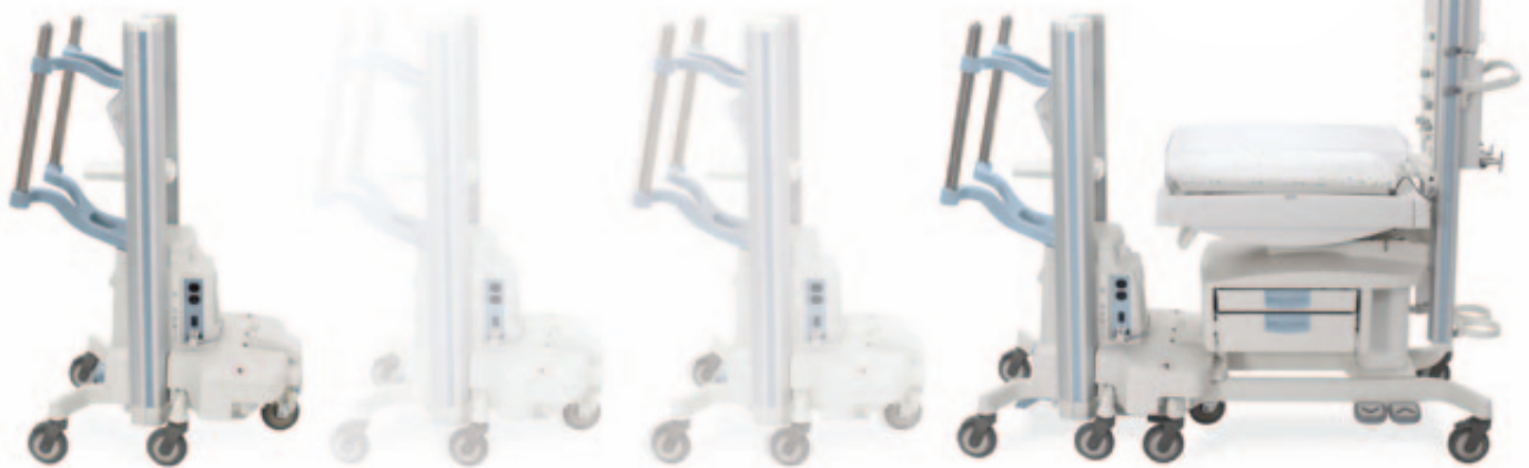
Panda® Warmer with Giraffe Shuttle