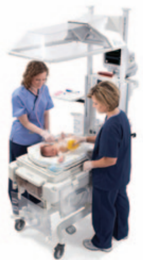
Giraffe OmniBed® with Giraffe Shuttle

One Baby. One Bed. From delivery to discharge.