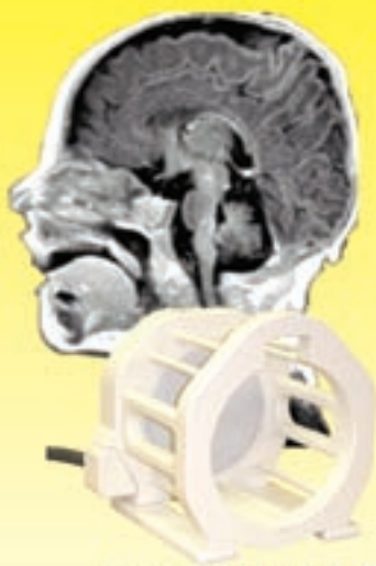
Neonate Head Coil