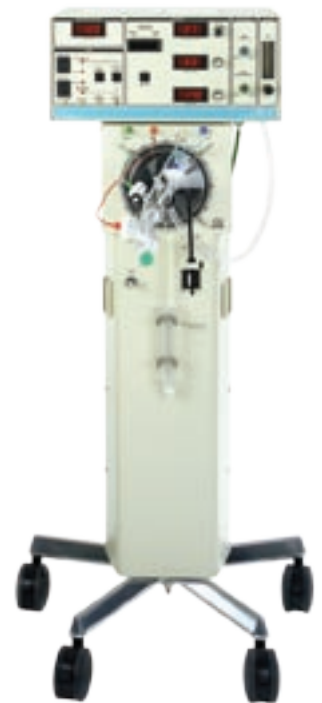
3100A High Frequency Oscillatory Ventilator

The 3100A stands alone as the only high frequency ventilator sold in the United States that does not require a second, conventional, ventilator.