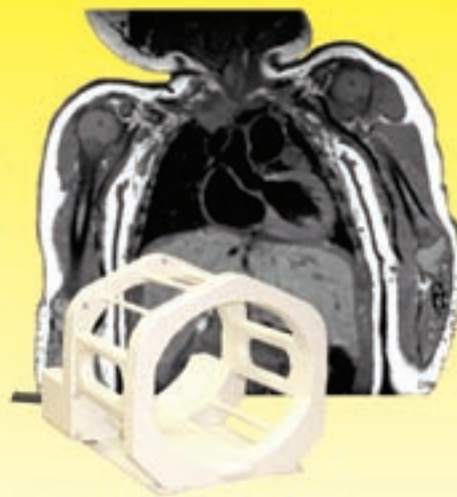
Neonate Body Coil